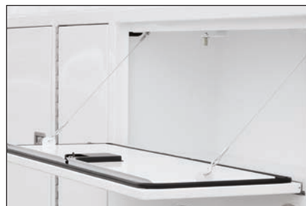
Flush mounted doors keeps contents secure, safe and dry