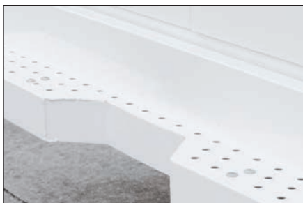
Heavy duty punched utility bumper allows user to step up safely